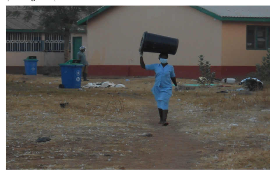
Figure 5: Waste worker carrying medical waste to storage site

With regards to the presence of means for the transfer of medical waste, all survey participants indicated that there is no means of transport to transfer waste to big storage containers from the various units. When asked how the medical waste is transported to the storage containers, they all said they carry on their heads ( See Figure 5 ).