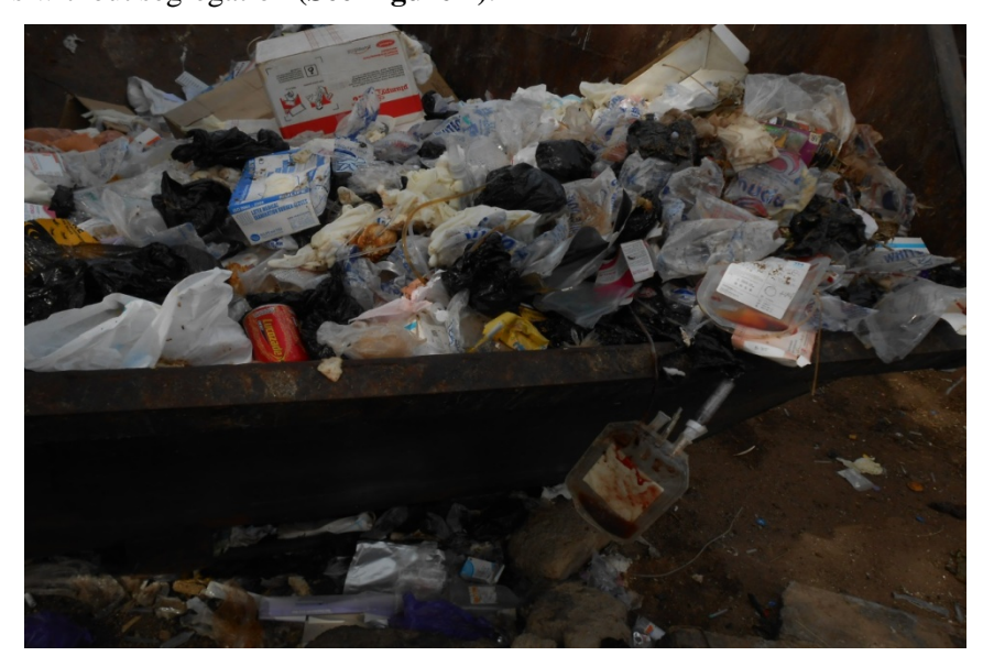
Figure 1: Mixed medical waste with ordinary waste.

Table 4 show the responses of waste workers responses on the separation of biomedical waste. Among the 15 waste workers interviewed, 13 (86.67%) indicated that waste is not separated prior to disposal to the larger storage containers in the hospital; while 2 (13.33%) responded that, the waste is separated before disposal. All the study participants said wastes from the various units are disposed into the large storage containers without segregation (See Figure 1).