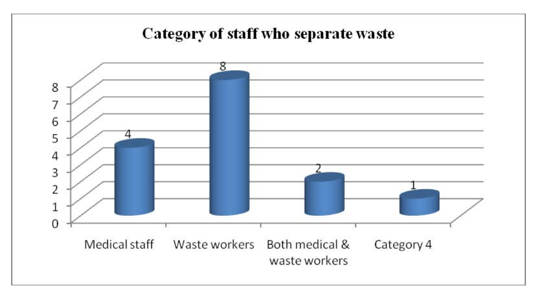
Figure 2: Category of staff who separate medical waste