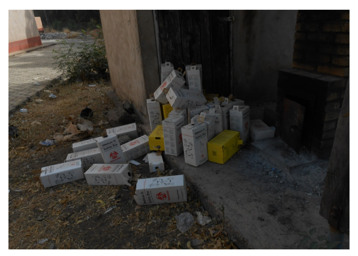
Figure 4: Safety boxes left outside the incinerated (source: field survey, 2014).